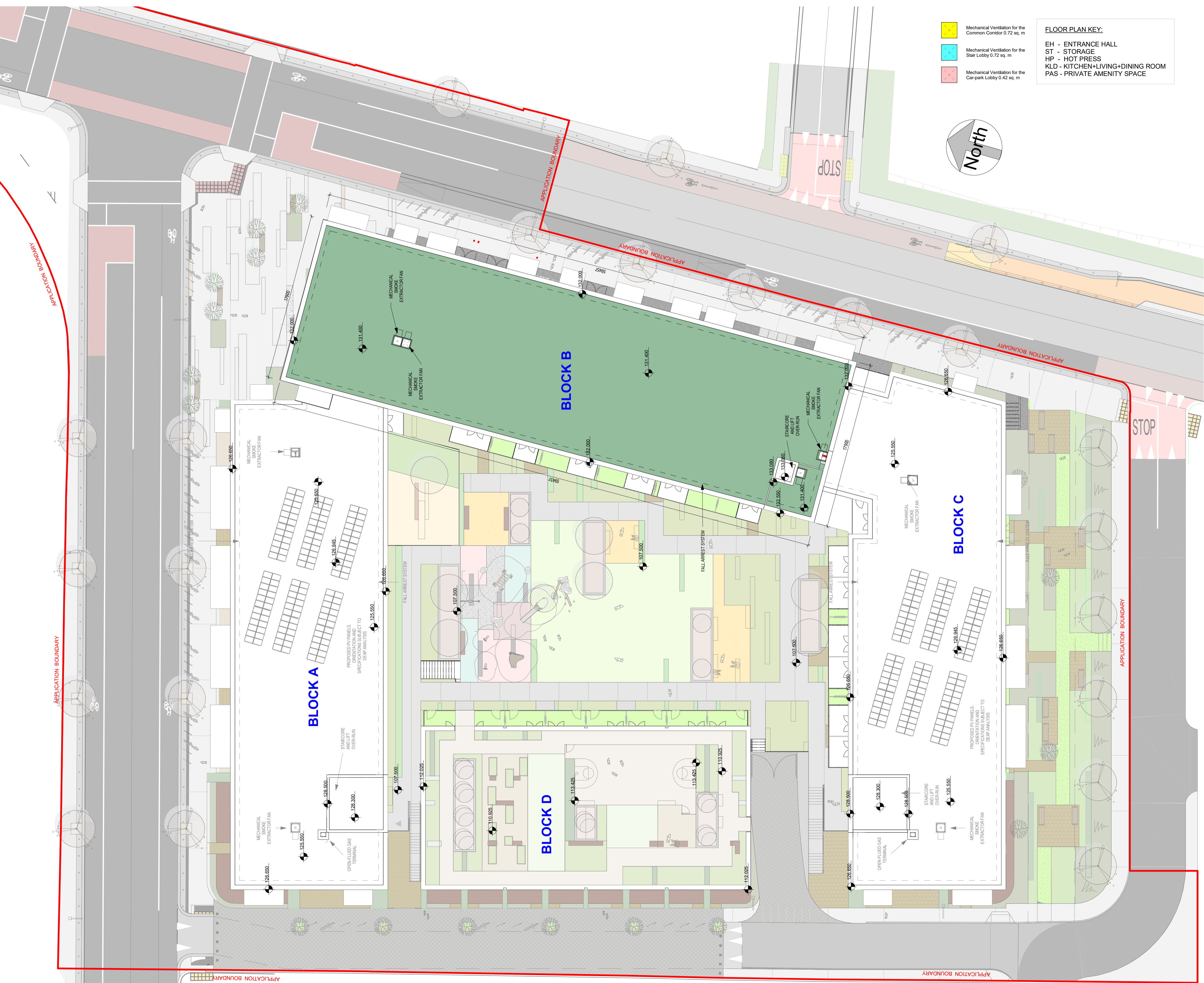
1 RF - PROPOSED ROOF PLAN 1:200