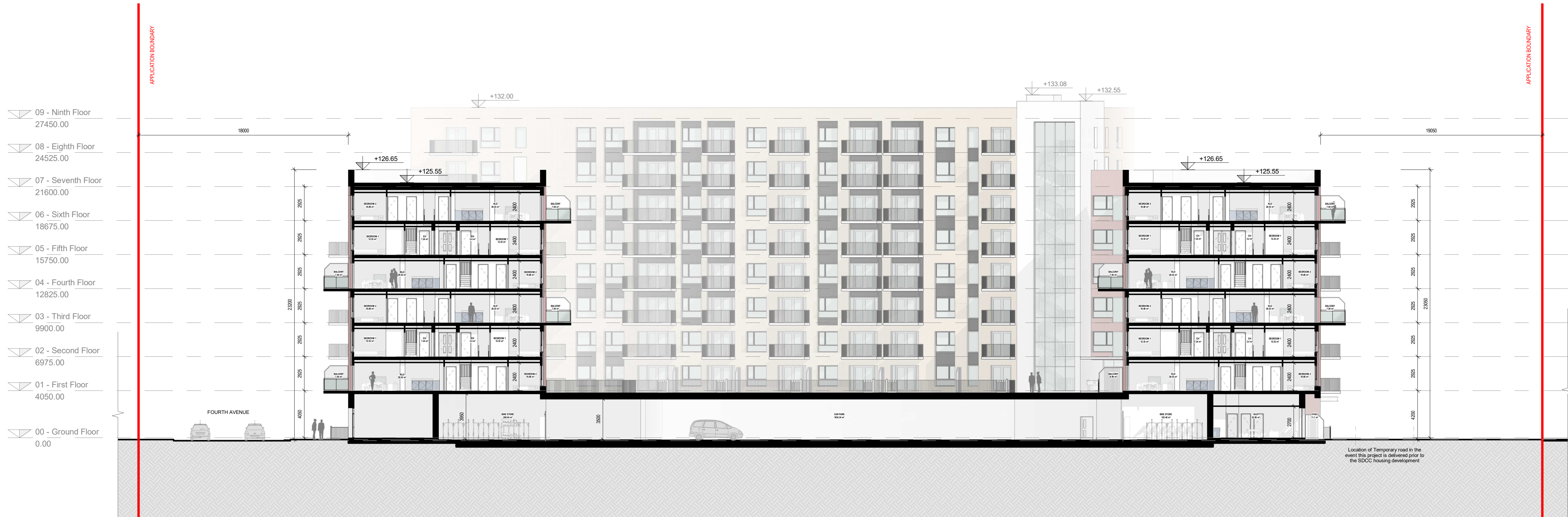
2 PROPOSED SECTION B - B 1 : 200