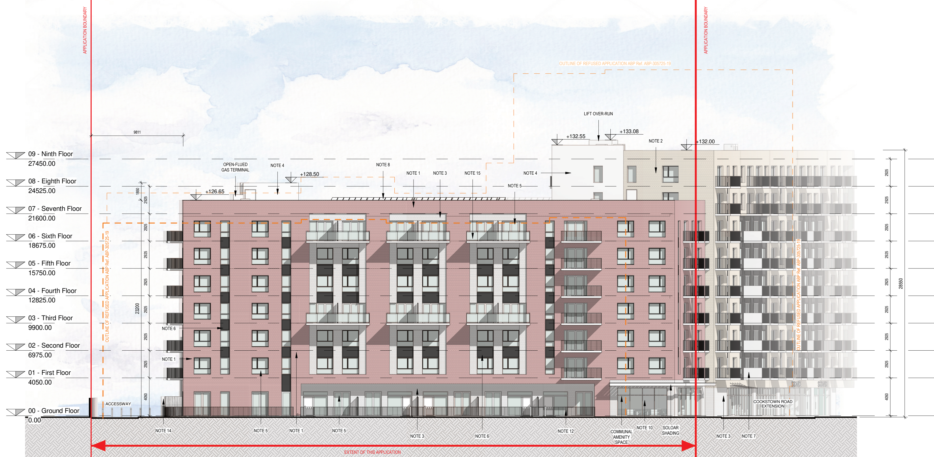
1 01 - PROPOSED SOUTH ELEVATION